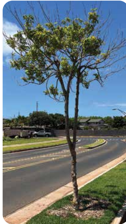
We have approved for seven trees to have root remediation.